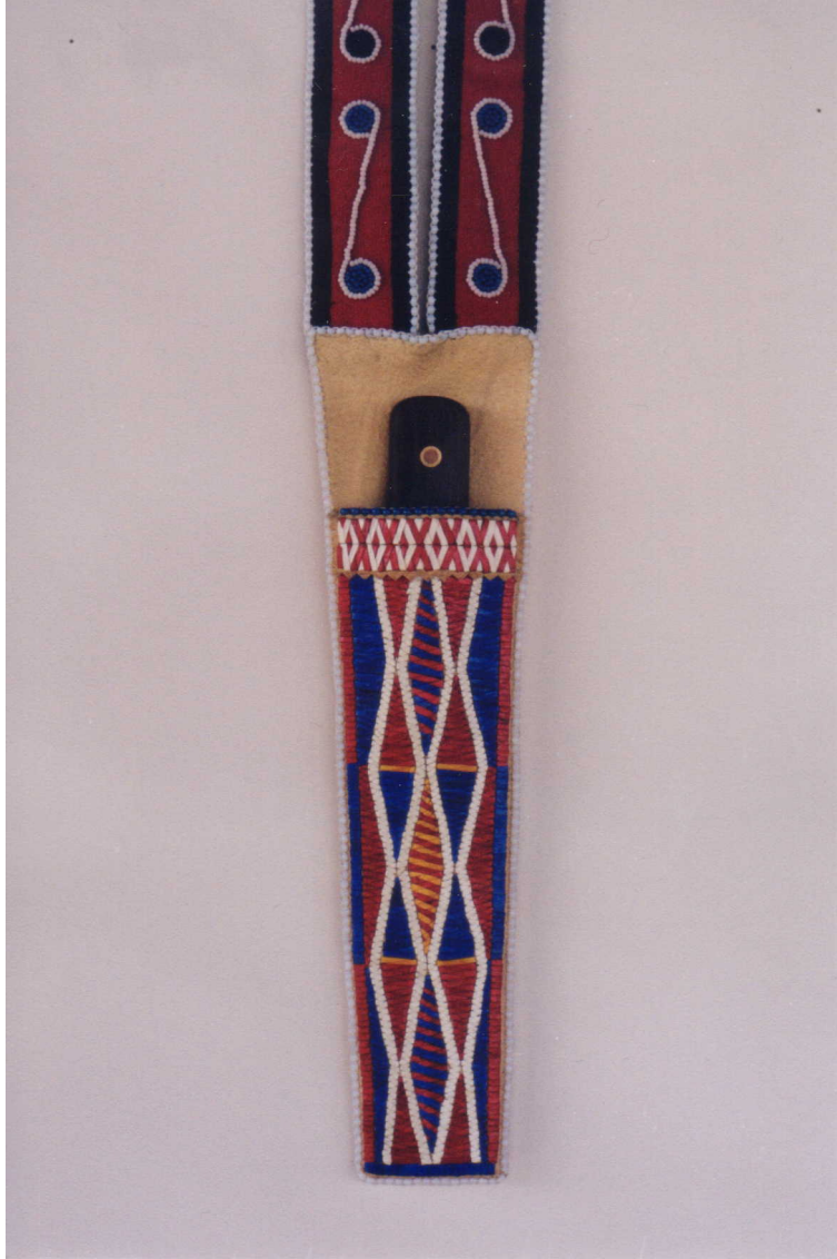
Geometric quilled Metis/Cree neck scabbard, ca. 1830.