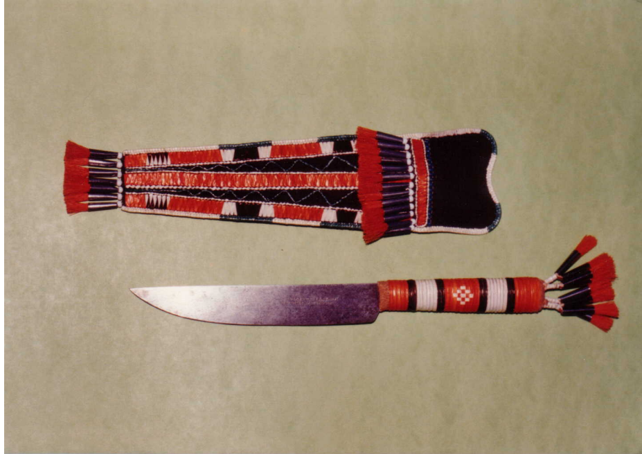
Quilled Delaware neck knife scabbard, quill handled knife ca. 1780.