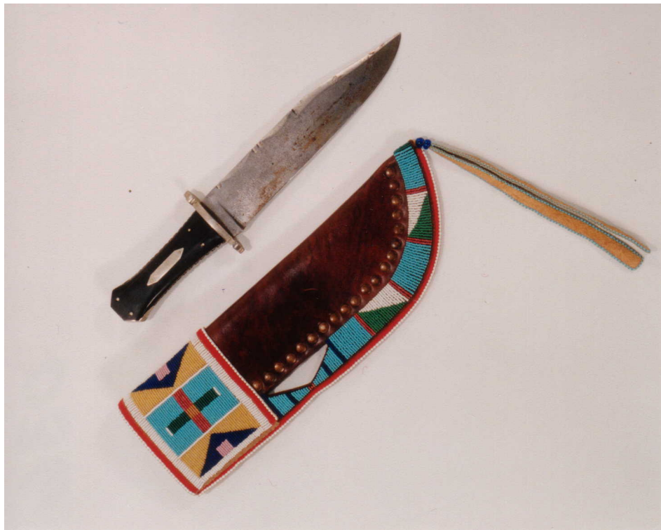
Knife scabbard, Crow saddle leather Bowie knife.