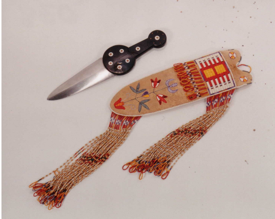
Quilled Metis Dagger scabbard, Hudson's Bay dagger. Ca. 1830.