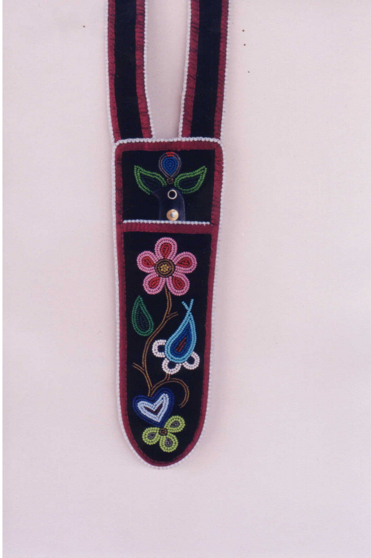
Floral seed beaded Metis scabbard, ca. 1840.