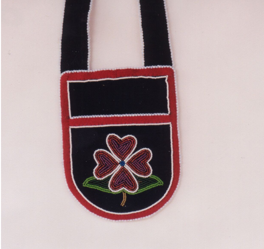
Floral seed bead Metis neck bag ca. 1840.