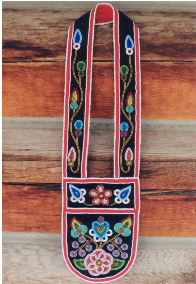
Floral seed bead Metis neck bag ca. 1840.