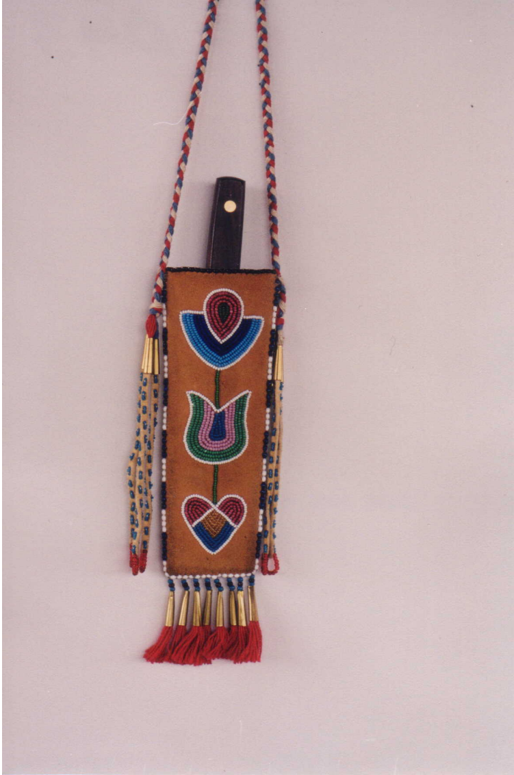
Floral seed beaded Metis neck scabbard ca. 1840.