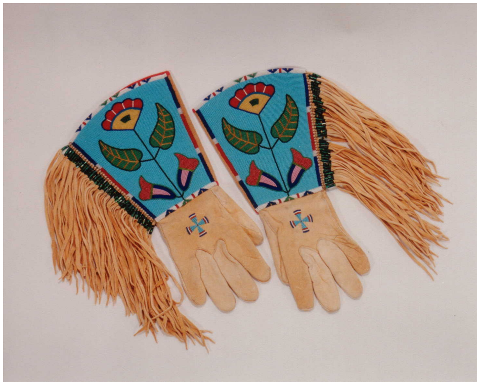
Crow floral beaded gauntlet gloves ca. 1880.