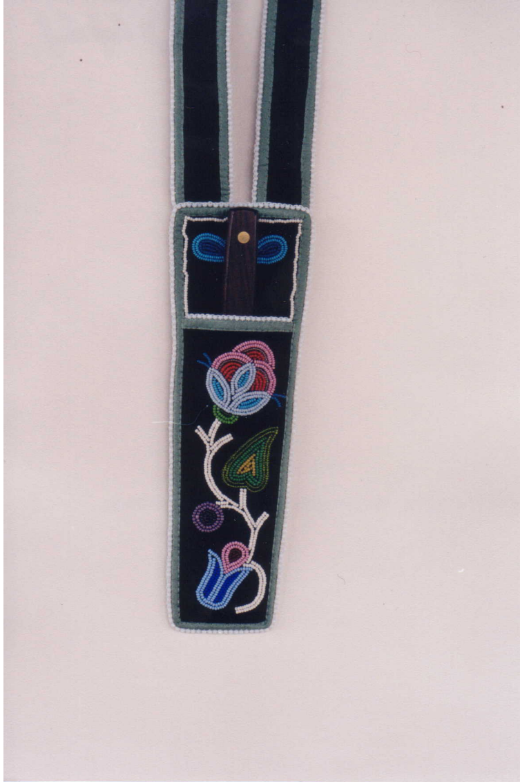
Floral seed beaded Metis neck scabbard, ca. 1840.