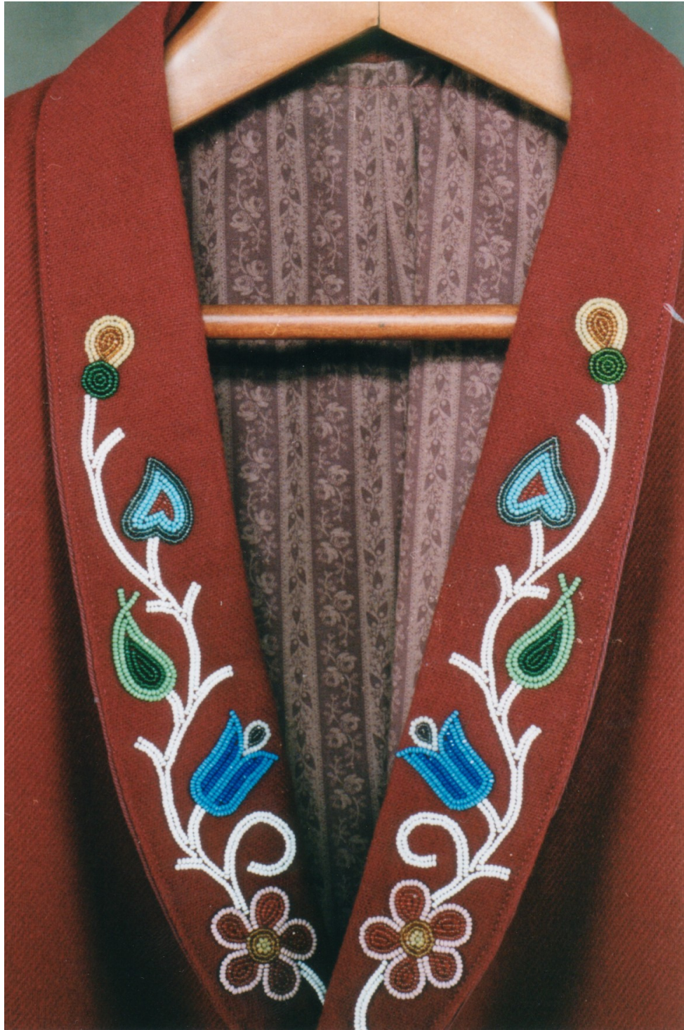
Close up of lapel area of a wool Metis vest, with floral beading, ca. 1850.