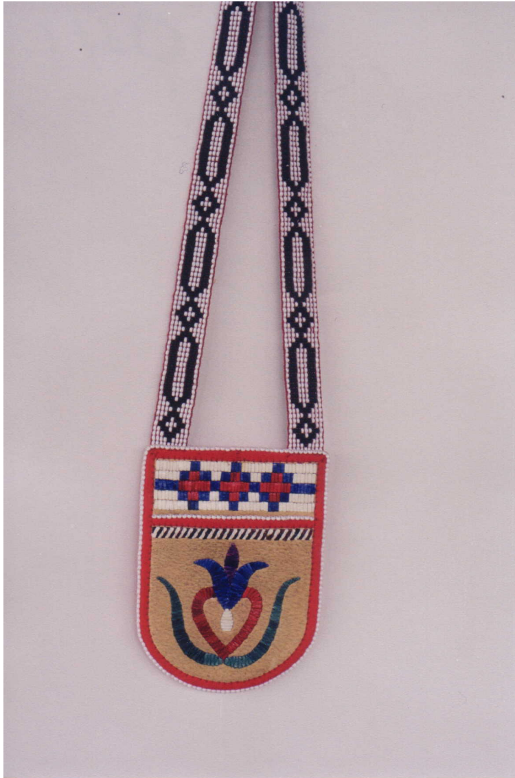
Floral quilled Metis neck bag with loomed pony bead strap, ca. 1890