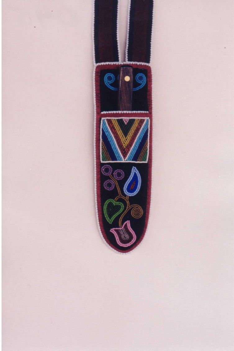
Floral and geometric seed beaded Metis neck scabbard, ca. 1840.