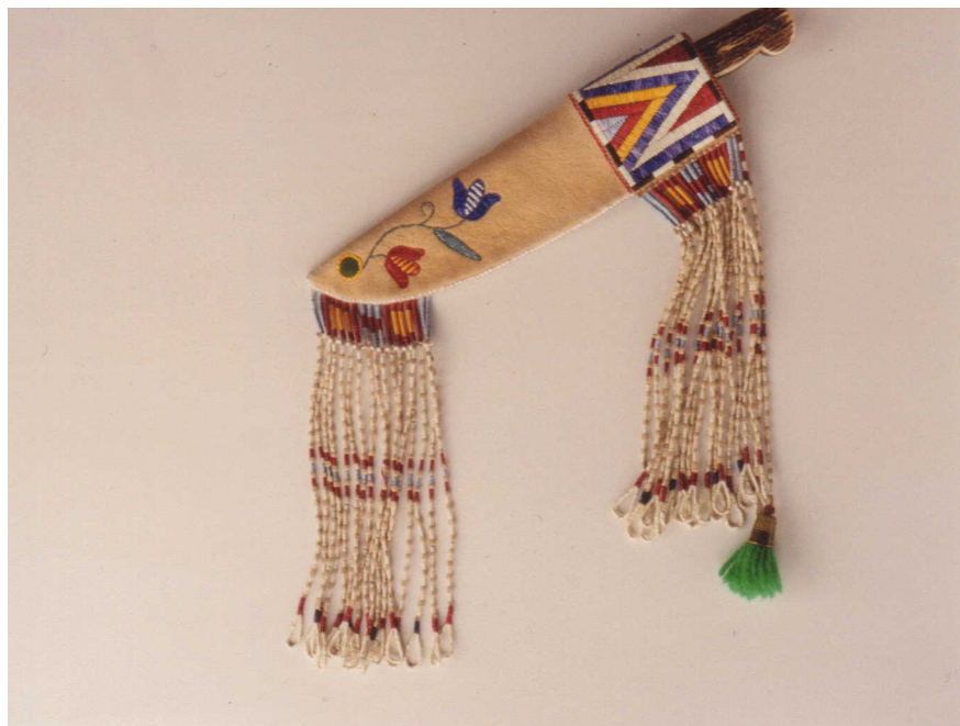
Quilled Metis knife scabbard with DeLaronde Knife ca. 1830.